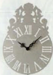
The age of embellishment is back. Reference: Urban Outfitters' Silhouette Clock ($32, URBANOUTFITTERS ).