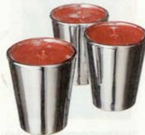
Vie Luxe St. Moritz Candles ($29 FOR THREE; 212-750-8288 FOR RETAILERS) smell of mulling spices.