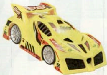
The Air Hogs RC Zero Gravity Micro ($30, TOYSRUS.COM ) drives up walls and across ceilings. Really!