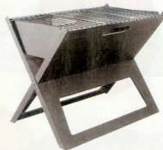
Score a touchdown with a football fanatic: Give him the folding Direct Designs Notebook Portable Grill ($42, APLUSSTORE.COM ).