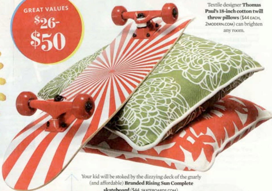
Your kid will be stoked by the dizzying deck of the gnarly (and affordable) Branded Rising Sun Complete skateboard ($44, SKATEBOARDS.COM ).