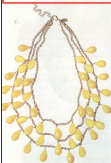
Anthropologie's Limoncello Necklace ($42, ANTHROPOLOGIE.COM ) looks rich but won't break you.