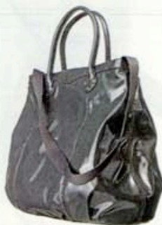
A patent leather tote is a fashion must for winter, and this one from Gap ($50, GAP.COM ) is just the right price.