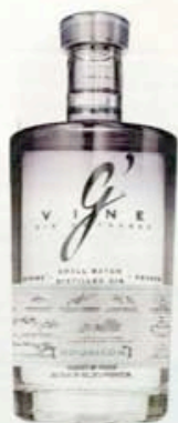
High-end gin for the price of low-end Scotch: G'Vine Nounison Gin ($40, GRANDWINECELLAR.COM ) is delicate yet spicy.